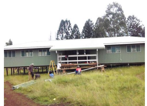
Above: Double classrooms near girl's dorm. Below: Dorm up-lifting, Admin extension.

Let us be happy and take care of what we already have and forget about complaining over what we do not have.