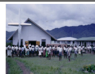
Proposed visit to Asaroka, PNG