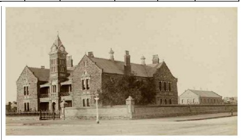
104 Jeffcott Street, North Adelaide - the site of Lutheran education for 90 year

jason@gglf.org.au 0403180607 youth.gglf.org.au