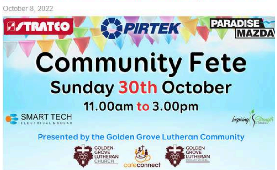
Play&Go website advertisement 2022