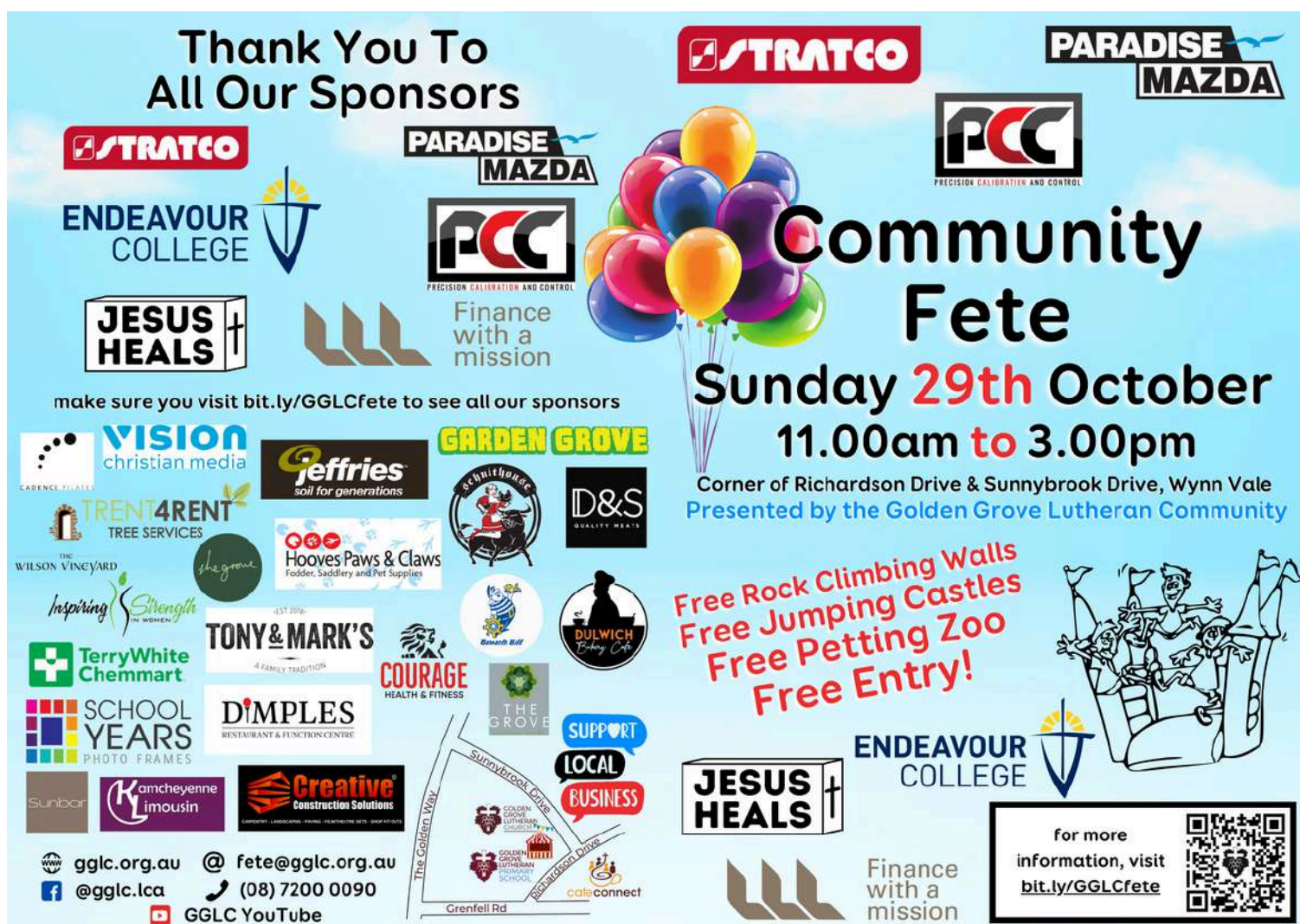
School Leaflet 2023

“It was a great event. I actually had my best ever day for sales at a market.” (2023 Fete Stallholder)