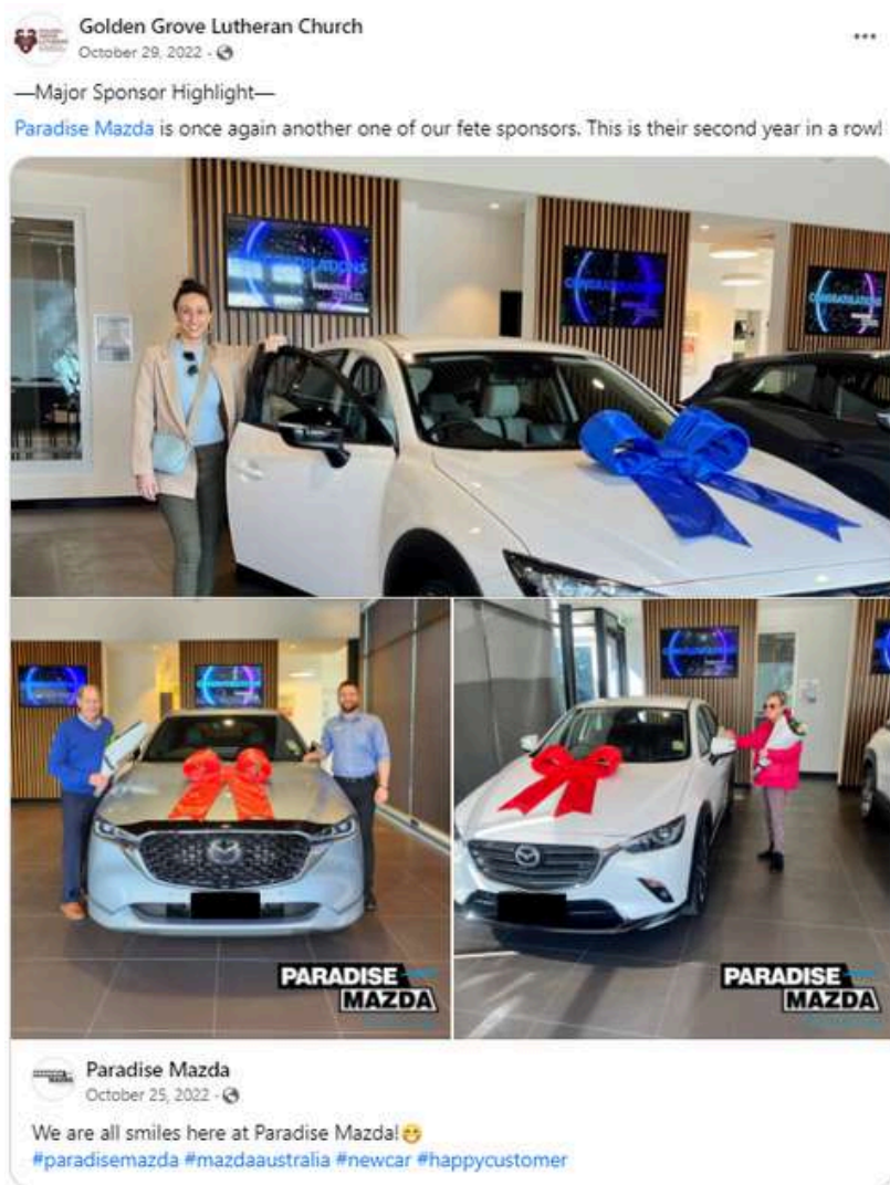
Social Media - Major Sponsor Highlight