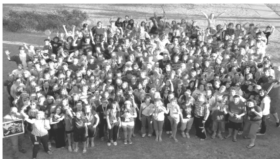
300 young people 'hungry' on Ypout