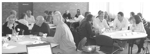
An afternoon of wrestling!

June/July Issue OUT NOW! Check your pigeon hole