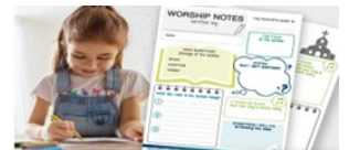
Worship notes to encourage your children during worship