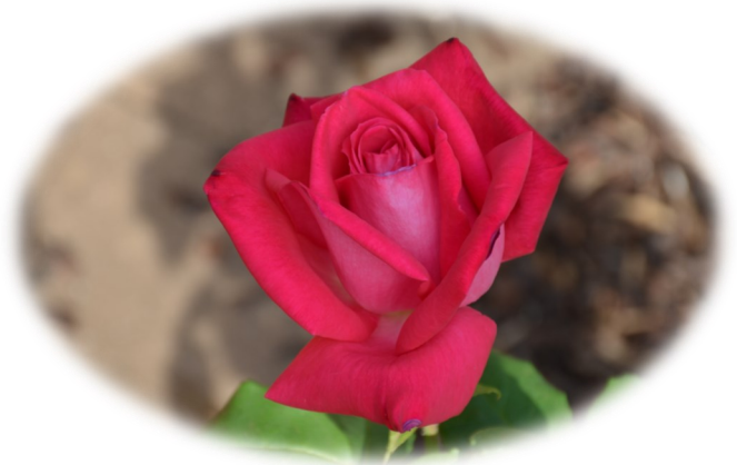
'Gift of Grace' Rose