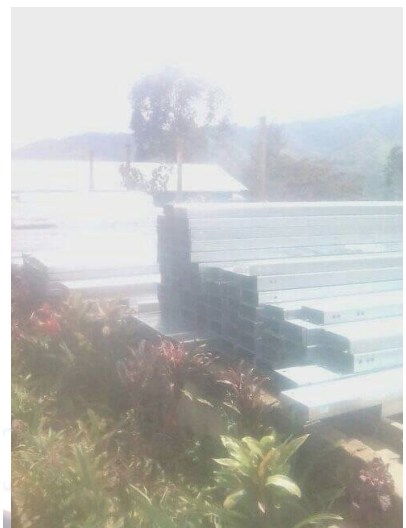
Building items stored on the old boys dorm that was burnt down