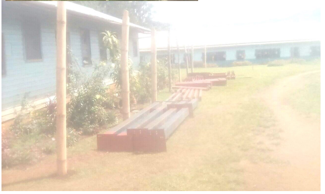
Site where the new building will go