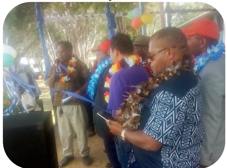
Right Photo Eastern