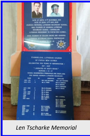
Len Tscharke Memorial