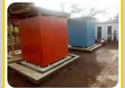
Ablution Block & Tuffa Tanks